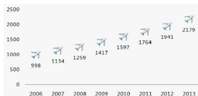
Fig. 2 2006-2014 number of civil aviation aircraft

Organization of the Text. This article intends to draw lessons from frontier service marketing theory, combine the reality of China's civil aviation market, to explore suitable for NF airlines development way of service marketing, the competition in the market, passenger demand, fully analyze the industry environment, using the advanced concept of service marketing and management theory, combining the theory and case, analysis of the defects in the current NF company's service marketing, and provide the basis for the future related to raise the capacity of the concept, build the NF airlines good customer satisfaction and loyalty, and expand the brand influence, thus to further improve the operation ability and competitiveness. The number of civil aviation aircraft in 2006-2014 is shown in Fig. 2.