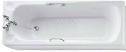
Figure 1. Dimensions of a typical bathtub

http://de-lune.com/dimensions-of-a-typical-bathtub/