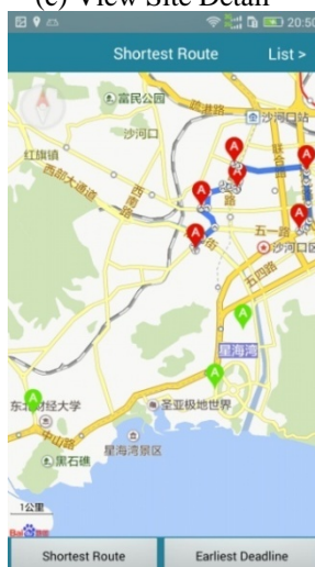
(e) Route Plan after Some Sites Are Checked