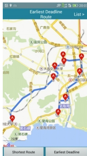
(b) Earliest Deadline Route