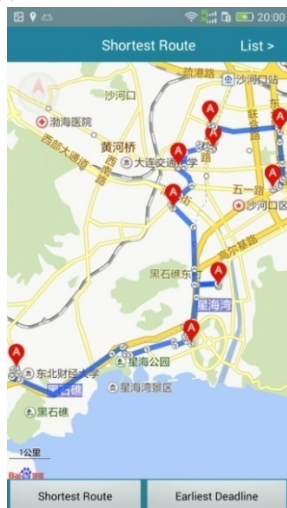
(a) Shortest Route

This paper implements the shortest route plan by introducing BaiduMap API to the system. BaiduMap API is a set of free interfaces developed by BaiduMap Service for the developers. This paper plan route in two ways: shortest and earliest to deadline. The nearest site to the inspector is the first to be visited. The nearest site to the first site is the next to one to be visited. In this way the system always find the nearest site among the unchecked sites as the next site to be checked until all the sites is visited, which is the nearest route. Arrange the sites by the deadline date and then plan the route among the earliest deadline sites in the way of greedy algorithm. Then the last site in the last shortest route is the first site to the second earliest sites. And plan the shortest route among the second earliest sites. The other sites should be done in the same manner. In that way, the route is the earliest deadline route. The route between any two sites can be gotten by the method named walkingSearch() of the class named RoutePlanSearch. Then the distance between any two site can be gotten by the method named getDistance() of the class named RouteLine. The route plan shows in Fig.3 below.