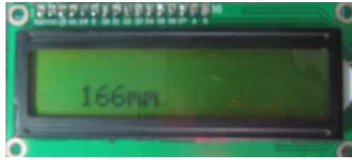
Figure 3. Distance display results

According to the above description of the design of the hardware circuit and debugging is completed, with the C language software programming, display the results as shown in Fig. 3: