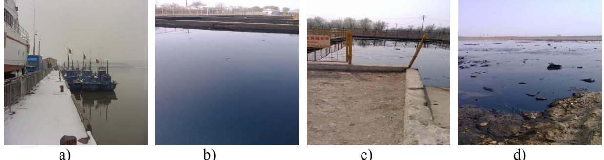
Fig. 1 a) seawater from location 1, b) slurry from location 2, c) dry soil from location 2, d) deposits from location 2.

As described above, samples for screening indigenous bacteria were obtained from two locations: (1) Beitang dock of Tianjin, (2) Tianjin Bihai Environmental Service Center of CNOOC (China National Offshore Oil Corporation). Fig. 1 showed the photos of sampling point.