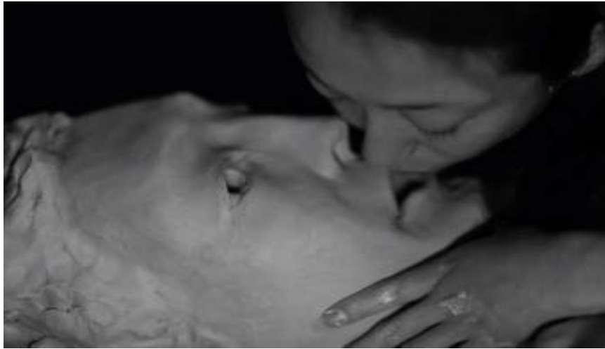
Fig.4 Geng Xue An Unfinished Slave

In addition, since material itself contains aesthetic value, the texture of different materials gives people different visual effects. So, material is an important medium to express the real emotions of a sculptor, who is able by virtue of imagination and talent to create works of aesthetic value, especially in the fine arts. As abstract expressionism master Kandinsky once said, "every work of art is the child of its age and, in many cases, the mother of our emotions. It follows that each period of culture produces an art of its own which can never be repeated", in the field of contemporary art, object and subject have undergone fundamental changes, and materials have been transformed into a special form of cultural expression. Contemporary Chinese sculptor Zhan Wang's "Artificial Jiashanshi series" [1], also known as Scholar Rocks, which he started creating in 1995, is the transcendence of materials, as well as the presentation of his concepts. He places both the actual rocks and their stainless steel versions together, and there is a remarkable contrast between them. He tries to express that we should be alert to human-environment relationship. It can be seen that, application of materials reflects the sculptor's unique creative language and artistic expression. At this time, material is not only a medium in the process of the artistic creation, but also sometimes even become a specific expression of the spirit of works.