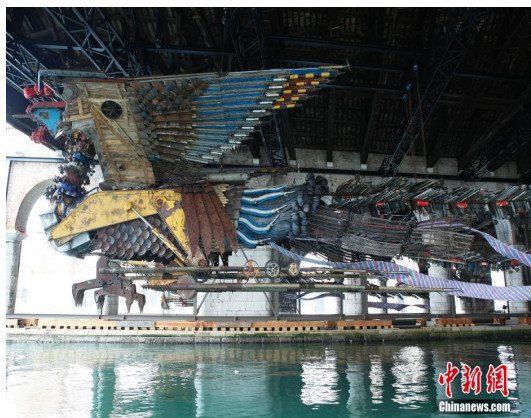
Fig.1 Xu Bing phoenix

Xu Bing, one of the world's most creative contemporary artists, believes that the relationship between materials and artists is essentially a source of inspiration. From the large-scale sculpture "phoenix" (Figure 1) can be seen, Xu Bing's choice for materials will not only satisfy her most fastidious demand, but also have highly cultural taste. Assembled with earth drilling machine, excavator, safety helmet, shovels, metal drums and other construction waste, this sculpture reflected Nirvana reborn of waste and metaphorical relation of garbage and wealth, also displayed realism, politics and profound moral.