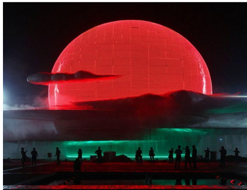
Fig.3 Lv Pinchang Sunrise of Poyang Lake

Lv Pinchang, professor and chairman of the Department of Sculpture in Central Academy of Fine Arts in Beijing, is a contemporary Chinese artist. His sculpture "Sunrise of Poyang Lake" (Figure 3) creatively uses LED surround video technology, also in a completely new way expresses the relationship between the public and public space, and effectively expands the sculpture's expressive space. The sculpture focuses on readability in an interactive manner. Light and music inside the sculpture, is an expressing means for this sculpture, and they even become major sculptural materials. The function of material in the sculpture is statement and expression. It is statement of material surface, and also is hearts' expression. Obviously, contagious material not only enhances the tension of mixed media to the modelling spirit, it is also a driving force to develop the creative thinking of artists.