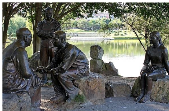
Fig. 6. Xiamen University Chen Jiageng and His Students