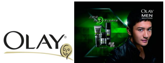
Fig. 3. Olay released Male brand.

In the field of skin care products also have an interesting change: Those brands which at beginning emphasized men expert or women dedicated cosmetics brand all chose "men and women-take-all." Olay no longer soft extravagance, but also learn to be drop-dead gorgeous! "Fig. 3". NIVEA is no longer "simple and tough", but plays a soft love. "Fig. 4". L'Oreal is unwilling to yield to others, it hired a lot of handsome guys and pretty girls. "Fig. 5". Why this change happened? Still it is the market working. According to statistics, current career men spent about 8-10 minutes a day on skin care and wash up, which is almost the same with women. "Beauty" is no longer unique to women. Changes in the target market make the original "eccentric" cosmetics brand start to "longing for change", they have put their hands into the camps which they ignored before.