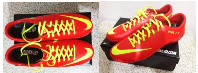
Fig. 10. The sport shoes which customized by student,the colors are selected by himself too.

Meanwhile, let's look at Nike and Adidas these two rivals' business strategies: they do not blindly expand the site, they turned to online business and specialty business. I have heard a very wonderful trick: DIY exclusive private sport shoes (clothes). You only need to add a certain amount of money, Nike will print (stitch) your personal "signs" on your products, such as the name initials, the main colors marching for the shoes , main image and so on, so as to make one pair of unique shoes in the world! The brand is called "NIKEID". "Fig. 10"; "Fig. 11"; "Fig. 12". Of course, in addition to shoes, it also include customized sports clothes. In this era of personality show off, which young people will not like it?