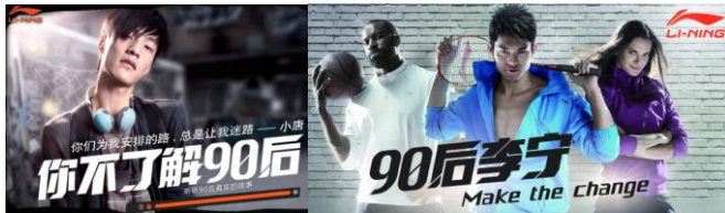
Fig. 9. "90s Li Ning" posters.