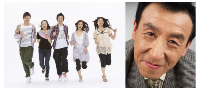
Fig. 6. Li Ning's actual consumer group has huge differences with the target consumer group.

Do you still remember Li Ning in 2003? "Anything is possible" has become a very popular slogan, even later the "impossible is nothing" of Adidas has copy suspicion. At that time, Li Ning considered its sales remain stagnant, so it invited the famous market research / consulting firm Gallup for consulting. Ultimately it came up with the conclusion: brand personality and brand image are seriously discrepancy, the actual consumer group has huge differences with the target consumer group. It changed from 18-25 year-old "young man" which Li Ning expected unfortunate incarnation of 28-45 year-old "uncle", it is the result which definitely not what Li Ning want to see. "Fig. 6".