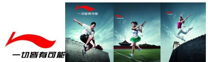
Fig. 7. "Anything is possible" series posters.

So Li Ning carried on the first reform, the excited slogan "Anything is possible" came emerged, highlight the vitality of youth and show themselves, within such youthful atmosphere, Li Ning re-established its young and progressive brand image. Eventually, with the help of 2008 Beijing Olympic Games, Mr. Li Ning who was the chairman and founder of the company lit the Olympic flame in person and pushed the brand onto the top! "Fig. 7", "Fig. 8".