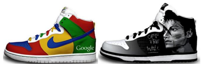
Fig. 11. Foreign customized NIKE basketball shoes.