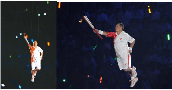
Fig. 8. Mr. Li Ning lit up the Olympic flame of 2008 Beijing Olympic Games.

In 2010 which happened to be the twentieth anniversary of the Li Ning brand. As China's most successful sports brand, Li Ning made a "big move". The Group replaced with a new logo, changed the "red flag torch" into "Li Ning cross", the slogan changed to "90s Li Ning-make the change " "Fig. 9". Intention was clear: attract a new group of "young people", continue to maintain its "youth did not fail" brand image. In this case 90s happened to be the major consumer market groups.