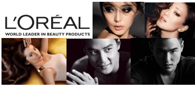
Fig. 5. LOREAL already male and female-take-all.

In the course of "Consumer behavior and psychology", I had worked out such a title for the students: "Economic rise of 'color man' ", focused on market changes caused by the "male beauty" phenomenon. A group of students even found an earlier and more mature market for "color man" economy: Wei-jin, Southern and Northern Dynasties - handsome man wantonly heyday. The literati and celebrities at that time simply "smug" to the extreme, many skin care methods are admired and surprised by today's girls! From this we can see, is not only the heart of beauty in everyone, but the "color man" even worse.