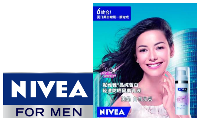
Fig. 4. NIVEA released Female brand.