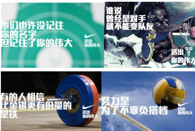
Fig. 13. NIKE: Find your greatness.

For the loyal fans over decades, Nike, Adidas also blowing retro nostalgia: sometimes promotes the concept of life (NIKE Find your greatness), sometimes shows fighting style (Adidas is all in) “Fig. 13”; “Fig. 14”, gradually sublimated the brand core culture, "inspiration, struggle" positive energy are all there, suitable for both young and old, everyone is happy.