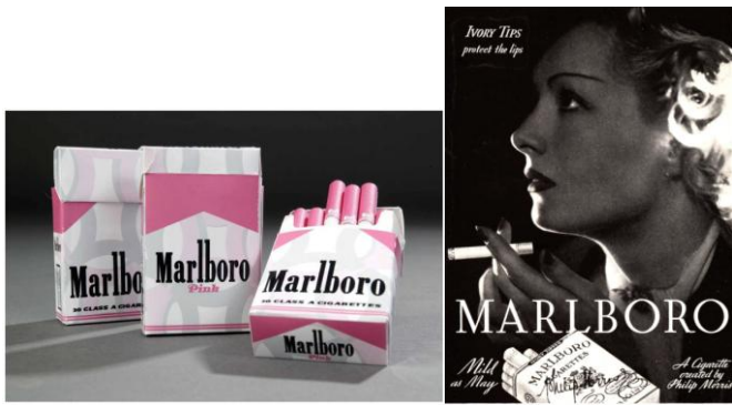
Fig. 1. The female image of Marlboro was once very popular.

fate of Marlboro lady cigarette, Morris Company finally stop the production of Marlboro cigarette in the early 40s (20th century).