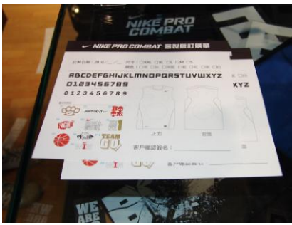
Fig. 12. Customized sport T-shirt.

For the loyal fans over decades, Nike, Adidas also blowing retro nostalgia: sometimes promotes the concept of life (NIKE Find your greatness), sometimes shows fighting style (Adidas is all in) “Fig. 13”; “Fig. 14”, gradually sublimated the brand core culture, "inspiration, struggle" positive energy are all there, suitable for both young and old, everyone is happy.