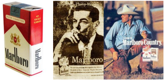
Fig. 2. Wild Western cowboy become Marlboro's new image.

Since then, the wild and gentle Marlboro was gone, replaced with a bold and rough Marlboro. In 1955, Marlboro won the country's top ten cigarette brand. In 1968, Marlboro single-brand market share rose to the second place in the country's tobacco industry. In 1975, Marlboro on the first place of the cigarettes sales in the United States. The mid-1980s, Marlboro became the leading brand in the world tobacco industry. In 1989, Marlboro sold worldwide 318 billion cigarettes, it is larger than the bottled Coca-Cola or canned Campbell Soup. "Fig. 2"