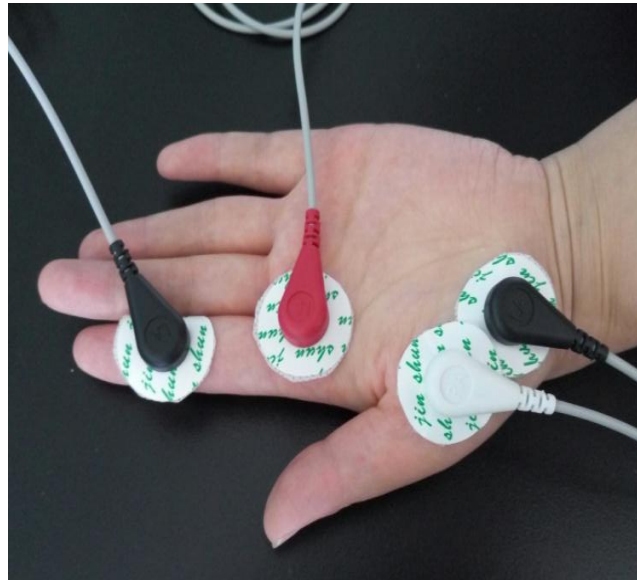
Figure 4 the surface electrodes of two refers grasping

Electrical stimulation to realize finger grip and three point to grasp and to stimulate the thumb grip in the same way, as shown in figure 4, figure 5, is no longer here