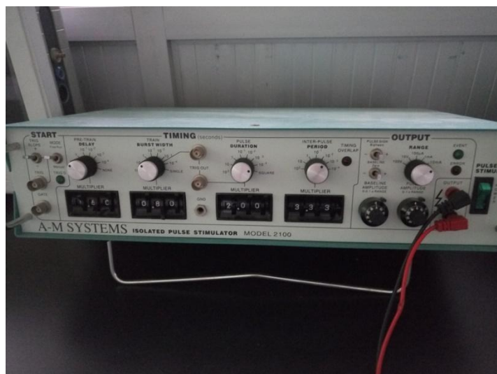
Figure 1. A-M electrical stimulator

Isolated Pulse Stimulator 2100 electrical Stimulator, as shown in figure 1, by setting the delay, Pulse duration, Pulse interval, Pulse width and the current amplitude to stimulate muscles to realize the hand grasping movements. The control part of the Isolated Pulse Stimulator of 2100 is divided into three modules, the beginning, timing control and output module. Start module includes trigger polarity, gating signal, trigger mode ;Timing control module is divided into four modules, delay, pulse duration, pulse interval and pulse width; Output module includes the choice of pulse polarity, the output voltage or current mode, pulse amplitude, baseline, trigger light.