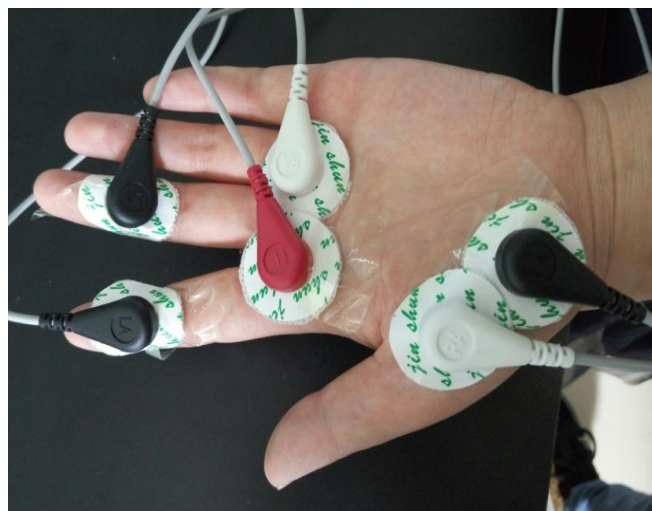
Figure 5 the surface electrodes of three refers grasping