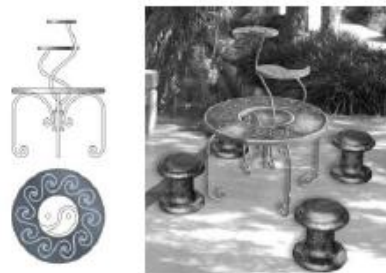
Fig.2. Outdoor stone table and stone stools