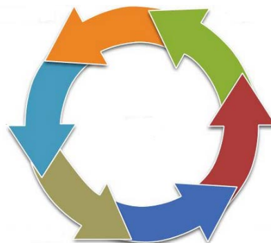
Fig. 2.The applications of decorative new technologies

In order to promote decorative construction industry, it is bound to the application of new technology, new technology and new materials, which have mastered the environmental, safety and efficient technologies and products in all aspects, must take precedence. Decorative construction relationship, so the application of new technologies to beautify the environment is very important. In order to strengthen the construction and decoration of new technologies application, we need to start from the following aspects [5] . Fig.2 shows applications of decorative new technologies.