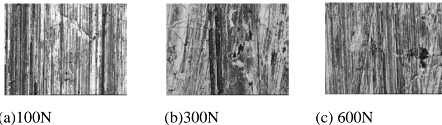
Fig.1. The surface topography of samples of disk under varied loads

The OLYMPUS optical microscope was used to view and take the image of disk samples under the illumination specifically. The domain of collection is the field of rub imprint. The megascopic multiple is 520. Fig.1 shows the grey images of taken under varies loads. From Fig.1 one can described the state of running-in surface qualitatively as a whole, but can not analyze the detail properties deeply, so need to further decomposition.