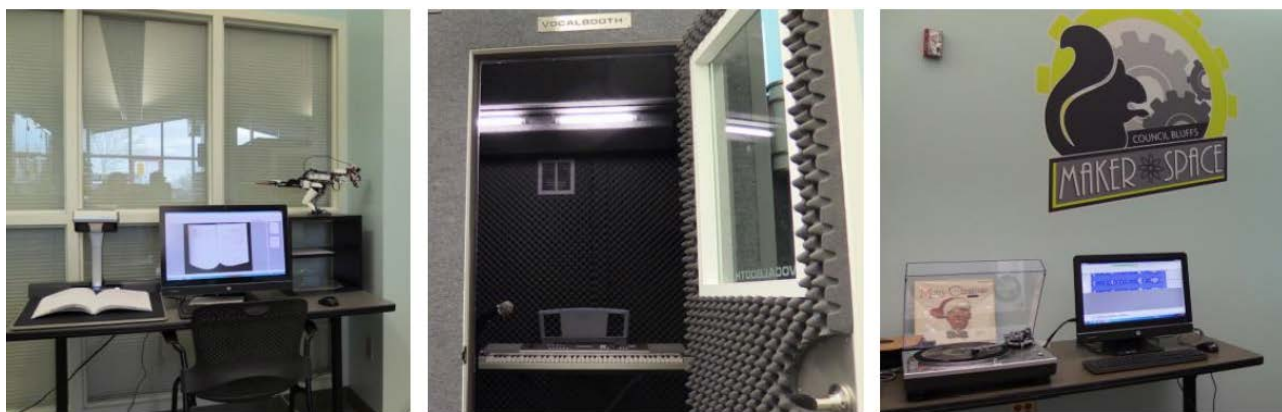
Fig. 2 The overhead book scanner (left), sound booth (center) and turntable station (right) at the Council Bluffs hakerspace.

Perhaps the most popular area with patrons is the digitalization station. Patrons can bring in personal recordings in a variety of formats, including VHS, 8-track and vinyl records, and make digital files of the audio and video recordings. Family reunions and dance recitals take on new life after decades in the closet. For family photo albums, a Fujitsu Snap Scan makes quick work of two pages at a time, and OCR software and facial recognition make pages searchable. After they are digitized, a 5-in-1 CD/DVD Duplicator burns five copies of the media at once, to hand out to family and friends.