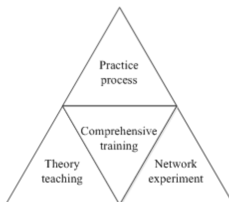
Fig.2.Network teaching system

practice at any time. As shown in Fig.2, the implement of network technology in teaching platform can be regarded as the innovation in experimental teaching and course design that not only step up technological methods, but also reconcile the practice process, theory teaching, network experiment and comprehensive training.