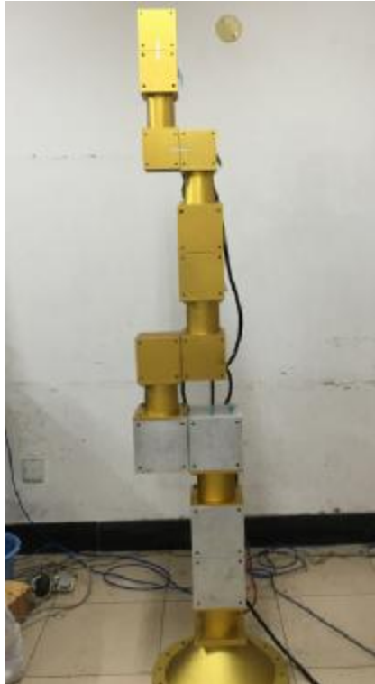
Figure 1 The 6-DOF modular robot