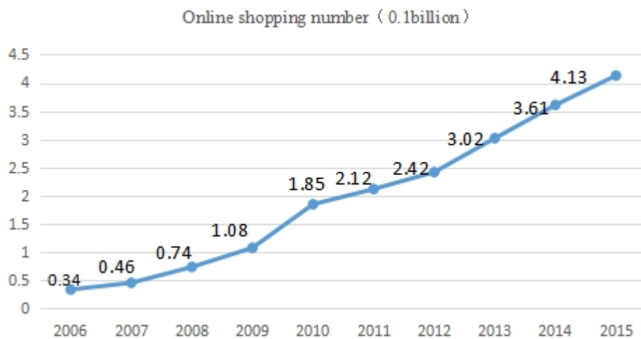
Figure 1. Online shopping number in recent 10 years in China

Survey has showed the recent number of Chinese online customers(see from figure 1) ,the growing speed of which has surprised many people as well as increased the attention on e-customers and their loyalty.