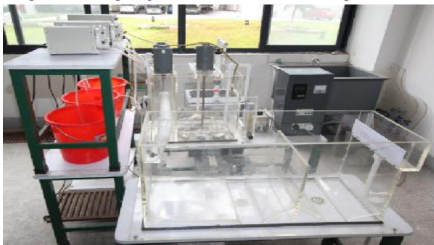
Fig.1 The pilot-scale experiment setup

The pilot-scale experiment setup ( Fig.1 ) was built on the research spot.