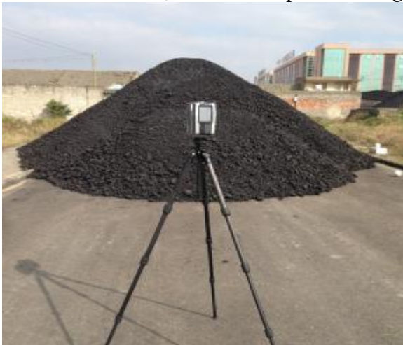
Fig. 1 3D scanner was used to scan coal pile