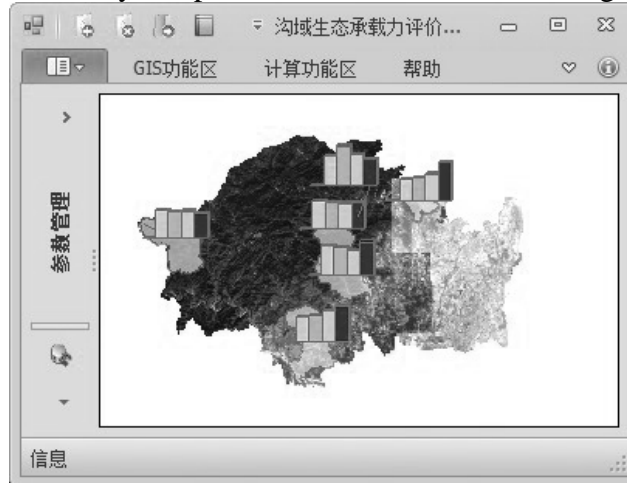
Fig4 Multi-channel analysis result display

After the multi-valley spatial analysis, spatial distribution is shown in Figure 4.