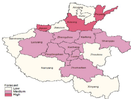
FIGURE III. THE FORECAST OF URBANIZATION GROWTH RATES (2016-2020)

With the development of social productive forces, the progress of science and technology as well as the adjustment of industrial structure, the urbanization development will continue to promote in the future. Using (2), (3) and (4), Logistic curve equation of each city is estimated, each city urbanization growth rates as well as the province urbanization growth rates in the next five years are forecasted, the results are shown in Table III, in which R^2 is the model residuals.