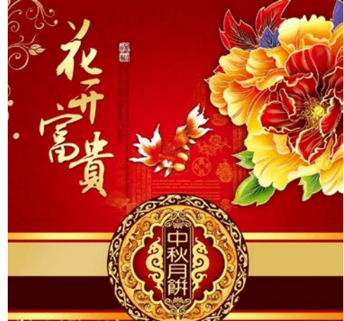
Figure 5. The packaging design of "the flower is rich"

As shown in Figure 5, the packaging design of "Hua kai fu gui", fresh and simple font and concise surrounding space leave consumers with a proper imagination space. In the three-dimensional packaging, it can also apply the text layout in the crossover of the packaging and products and strengthen the link between packaging and products. Select the fan Chinese characters font adornment that has the ancient charm. In the external package, butterflies and peony full of vigor and clearly reflect the elegance of the gift, and in the use of "Hua kai fu gui" [9] these four words, use different fonts, words of different sizes with outstanding features brand, the packaging design using text graphic, in addition to retaining the blossoming text marks, red peony and butterfly and a small amount of commodity information, almost no longer use any decorative patterns. The overall effect is simple and bright packaging, achieving visual effects and psychological effects and conveying a calm attitude of a long history and taste of life. This design full of text graphic makes the entire packaging more prominently showing brand image, successfully achieving a balanced consideration of its function and emotional appeal.