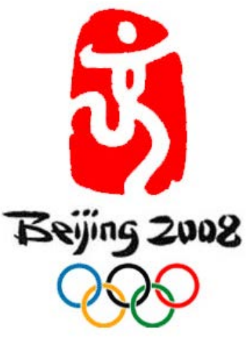
Figure 2. The logo design of "Chinese seal" in Beijing Olympic Games

"Humanistic Olympics" [4]. The text of the modern image fuses the "Beijing Olympics", "humanities" and "sports theme" these three themes information at the same time, and display in the form of the most profound ancient art of Chinese seal, which not only highlights the time theme of the Chinese characters graphical feature, and display Chinese ancient culture and art to the world, to spread the Chinese culture. Figure 2 shows "Chinese seal" logo design in the Beijing Olympic Games [5].