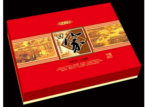
Figure 4."Hui Jia" moon cake packaging design

Split the strokes of one or more Chinese characters and reconvict the structure, then the identification of text is reduced, but the graphical feature is enhanced, generally requiring comments. After splitting, the re- combining text loses the function of straightforward interpretation, but new graphic form has a more profound meaning. As shown in Figure 4 [8], the moon cake packaging, the two words "Hui Jian" are combined and skillfully transformed, fully embodying the best wishes of going home to reunion the family members in Mid-Autumn Festival, packaging vividly and iconically conveying the main idea of products.