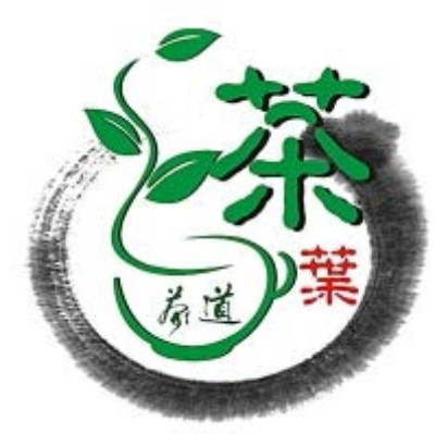
Figure 3. Packaging design of tea

The calligraphy ink has a flow direction, the writing process itself that cannot be repeated is a kind of graphical representation, and also a representation method of time to drive space and the action process to drive visual. For example, tea art design in Figure 3 is to present in the text of the ancient calligraphy, in which China text charm fully reflects the green charm of tea. Art design is the first impression of products putting on the market. The design of tea packaging in Figure 3 gives the new initial impression, making the good sense for consumer. Figure 3 shows the packaging design for a tea [7].