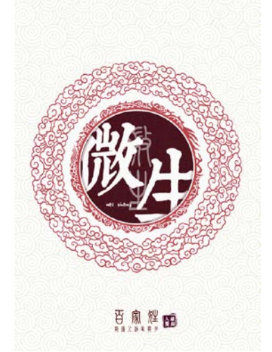
Figure 7. Art design of record cover?

According to the Chinese characters font, extract various patterns, and through the combination of lines, they can be used to China card design. For instance, the design in Figure 7 [11], it not only refers to the quotation of characters' font record card, but also the inheritance of Chinese cultural and artistic spirit. With the rapid development of music and computer art design, Chinese characters font culture began to spread in the faster and newer channel in the form of Chinese characters font record card, so the font Chinese characters art and modern graphic design are connected, to realize the harmonious co-existence of music and painting. Thus, record appearance has strong ethnic flavor, and do not lose fashionable breath, which not only reflects the music theme of records, but also the album covers full of cultural heritage. Figure 7 is the art design of the record covers.