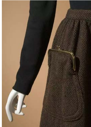
Fig.7 pocket with clip mouth

In the common auxiliary materials for pockets, zipper, magic stick, and studs were in the majority; for fulfilling the convenience and quickness of the mouth, the applied parts and functionality could play many creative effects. Pocket designs in Fig.6 and Fig.7 flexibly used the functional elements in the bag/suitcase design for reference, so that the designs looked fresh and new in both details and functions.