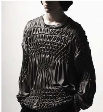
Fig.8 pleated fabric design

When pleating technology was comprehensively applied to a dress, the integration of process design with structure design jointly controlled the overall shape; as shown in Fig.8, in the pleated fabric design, the transformation of many fabrics was a source of the inspiration for clothing creativity; when the process made the fabrics change, clothing structure and shape were required to cooperate with the process for presenting the overall clothing design characteristics; the early creative inspirations were naturally transformed as aids from the process change.