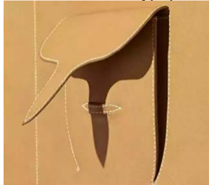
Fig.5 three-dimensional box-type pocket (opening)

The above four pocket designs looked distinguishing in their styles, but the starting points in these designs were divorced from ordinary pocket formative technology—a breakthrough was sought in the pocket production process: the change of process change was integrated with shape; these exquisite pocket designs would never be achieved if designers did not know well the pocket processes.