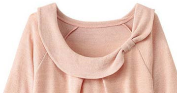
Fig.10 Beam knot collar

Designers usually took the production process effect into consideration in the style design and would reflect in the design; as shown in Fig.10, the processing for the beam knot collar improved the point for the designed style. In Fig.11, in the buckle design for the shoulder of side buckle shawl collar, a scarf collar style was formed through fixation. Thus, an understanding of technology was closely related to style design: the integration of process design into details could not only generate rich styles, but also increase the functions of clothing. The connection forms such as nail catcher, zipper, and ropes in clothing would play a different effect in terms of the appearance.