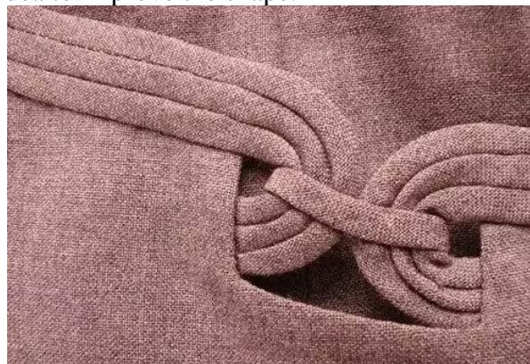
Fig.3 knotted, superimposed decorative artistic pocket

On pocket decorations, fit strips, trim strips and mixed strips could play different exhibition effects; as shown in Fig.3, the implementation of the process for knotted, superimposed decorative artistic pocket demanded a three-dimensional morphological analysis on three knots of both sides; the pocket mouth was composed of six independent manually-spliced strips. Designers needed to know well the implementation process from the three-dimensional shape of the pocket mouth, before they were integrated into the design idea to improve the shape.