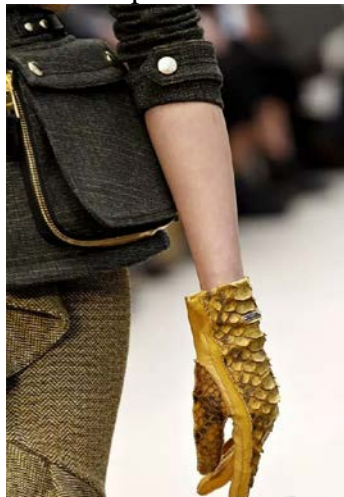
Fig.6 box-type pocket with expanding zipper

The application of auxiliary materials to pocket process. There were also many common understandings between clothing pocket parts and bag/suitcase design; in design of luggage, there was often a design of expansion layer to adjust the volume by the closing and opening of zippers, thus letting the loading volume of luggage expanded by more than 20%. As shown in Fig.6, the sides of expanded zipper box-type pocket added the volume using the closing and opening of zippers; on the process design, the luggage processing way was introduced, making the pocket artistic and highlighted. The pocket with a clip mouth was a common form of vintage pockets; in fashion design, a closing function was often seldom designed for the mouth of pockets; as shown in Fig.7, the autonomous, flexible and convenient use of clip was realized in the form of the clip mouth of pocket.