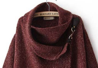
Fig.11 side buckle shawl collar