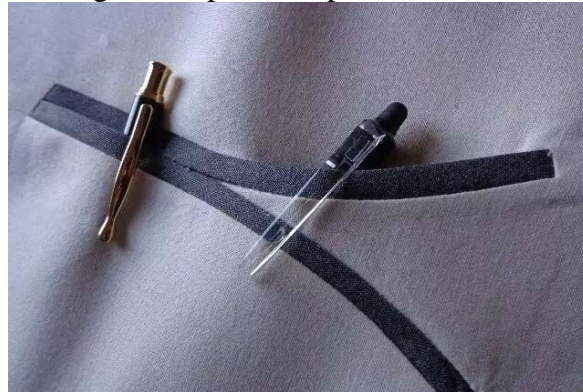
Fig.2 double-arc, separate welt pocket

Welt pocket was often designed in a form of straight slit pocket, in which arc design process was with some difficulties, but could play a better visual effect. As shown in Fig.2, the arc slit pocket design with double-arc, separate welts was more challengeable from both technology and process. Additionally, the shape of welts was distinctively hierarchical and streaky; assorted colors were applied to slit pocket cloth, making the shape of the pocket remarkable and beautiful.