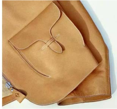
Fig.4 three-dimensional box-type pocket (closed)