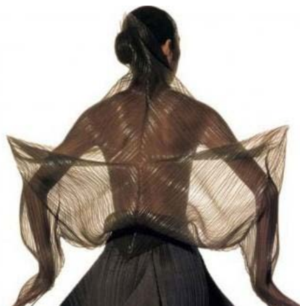
Fig.9 Issey Miyake pleats design

In the current fabric transformation, new technologies are used for making more breakthroughs [6]. In the process expressing techniques and fabric post-processing technologies, new equipment and technology are used for implementing the modern technologies such as anhydrous textile printing, intelligent embroidery, computer weaving machine, computer jet printing, and digital printing [7]. For example, pleated fabric processing is a fabric post-processing technology to form thermally-deformed pleats. The redesign of the fabrics processed with hot-pressing technology is another creative form. As shown in Fig.9, the early process infiltration of Issey Miyake pleats design played a direct influence on the design again. Issey Miyake, Japan's famous fashion designer, was reputable in the world because of his extremely high process innovation; he discovered the source of vitality of fashion design by differing from the western clothing design ideas, sought for the beauties of new clothing functions, forms, and decorations from the eastern clothing culture and philosophies, devoted himself to the integration of fabrics into fashion design, and finally designed unprecedented new concept clothing works [8].