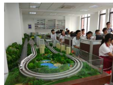
Fig.2. Examples of combination between Shanghai university laboratory and middle school Innovation experiment.