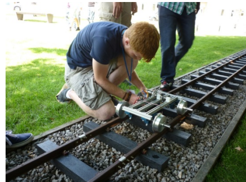
(a) Railway model experiment

quality and sustainable development capacity [8]. American Government also enacted the "teaching for innovation" plan, providing professional training for thousands of new science teachers [9].