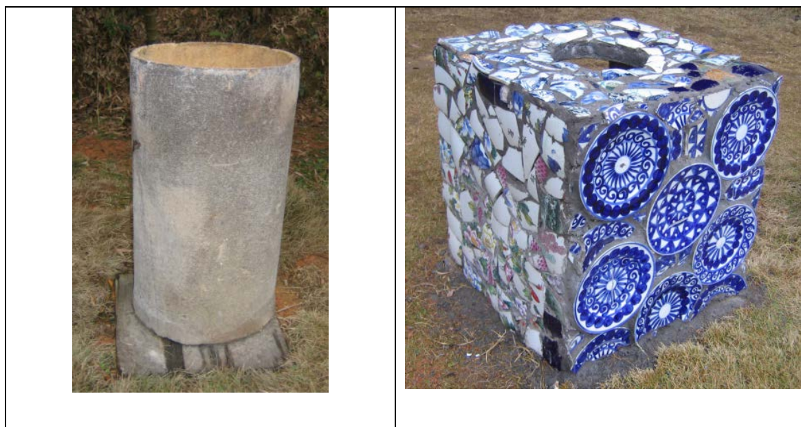
Figure 6, sagger garbage can photography