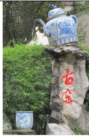
Figure 11 equilibrium composition

The first, is in a memorial garden or greening of public buildings and classical garden before pairs of stone lions, locust tree, even the road on both sides of the street trees, flower beds, sculpture, and so on are used to take static symmetry to composition, especially in ancient kiln scenic spot to visit the roadmap to axis as the center, under the condition of relatively static, left, right or upper and lower symmetry form, in making porcelain craftsmen and tourists psychology is characterized by stable, solemn and rationality is one of the ancient kiln content to express the beauty of landscape.