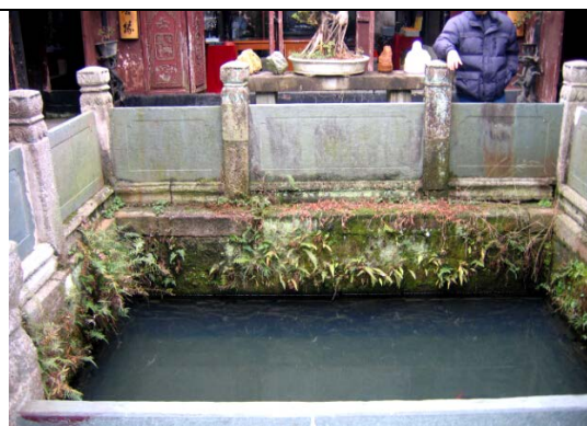
Figure 2, hall patio photography

The ancient site of the residences and ancestral temple buildings, the central hall USES the atrium structure. Patio is the main part of the first hall, in addition to the courtyard has the function, such as lighting, ventilation, drainage or housing function extension and indispensable supplement. This kind of structure and courtyard TianJingShi there's a difference, patio is the internal space of the building itself, looking down from the sky, like to open a mouth of the well (see figure 1). The