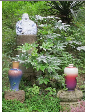
Figure 10 equilibrium composition

2. Porcelain making craftsmen are often revolve around a porcelain making process as the main body and thus for the series of porcelain making activity, resulting in a symmetrical and balanced composition of porcelain manufacture. This is a composition law to express the beauty of landscape, it is a system of porcelain production line as the axis, forming around or up and down on the amount of equality. It is porcelain craftsmen in the long-term social practice activities, by itself, observation on the surrounding environment and the law of structure embodies the thing itself a way to comply with the rules of formal beauty exists (as shown in figure 10, 11).