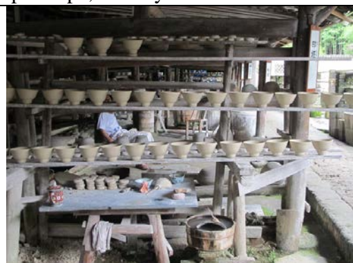
Figure 8 lines beautiful photography

The ancient site of the building from the aesthetic appearance, its form mainly has beautiful line (see figure 8, 9), the graphic beauty (see figure 10, 11), shape beauty, light and shadow color beauty (see figure 12), and so on several aspects. Jingdezhen porcelain kiln in the long-term system of labor practice, in accordance with the law of form conforms to the features of beautiful shape the landscape shape, thereby further found out the regularity of formal beauty.