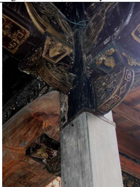
Figure 3, the structure of the ancestral hall and photography

JieGouMei contains support in the sense of building structure, the supporting structures to form, and provide the required to use a function space, therefore its structural system and structural form of building strength, stiffness, durability and stability factors.