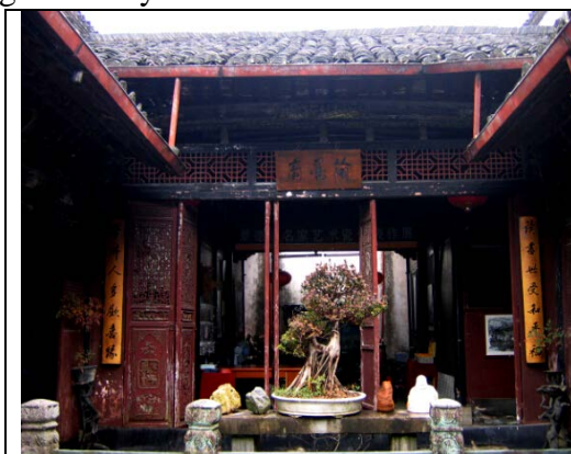
Figure 1, jade ITO patio photography

Function of beauty is human in the broad range of production time to create the beauty of a physical entity; Is intuitive form embodies beauty; Is also reflected by the construction materials and structure of the beauty. Function the technology in material goods the dominant. Especially in building more embodies the combination of functional and artistic. Ancient site construction of this functionality in the ceramic workshop, in the town of kiln, dwellings, ancestral hall and other buildings are fully reflected.