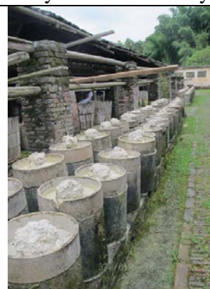
Figure 9 line beauty photography

1, porcelain making process is the main theme to express the beauty of garden landscape of the ancient kiln, porcelain making is the center of gravity or key of space composition, also play a leading role, the rest of the sun pond and bask in billet just foil or foil effect. Such priorities, bring out the best in each other, can coexist in the composition of unity. So the whole ancient kiln