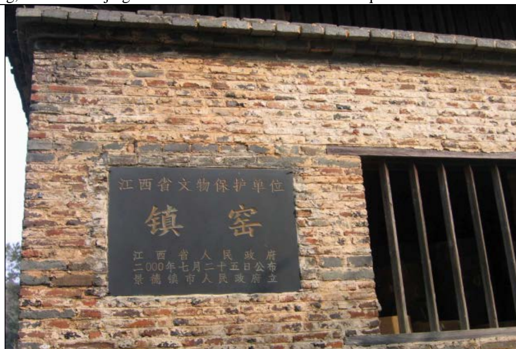
Figure 5, the kiln brick wall