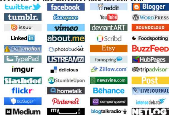
Fig. 1 The Reflections of the Internet and Media Era

the transformation and the innovation of spirit education for college students work. In the following figure one, we show the reflections of the Internet and media era.