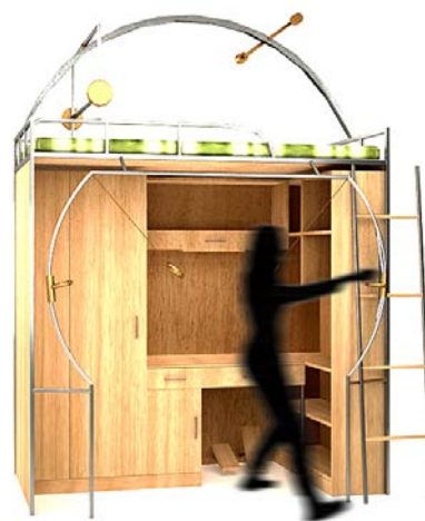
Fig. 9 Push up motion