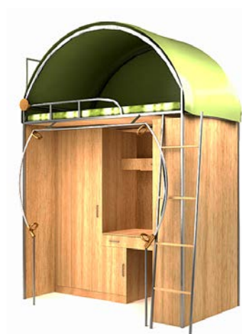
Fig. 5 Mosquito net