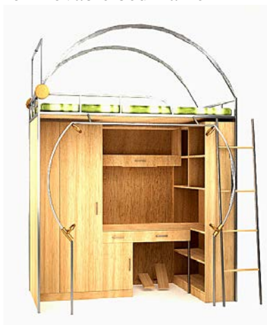
Fig. 4 Frame