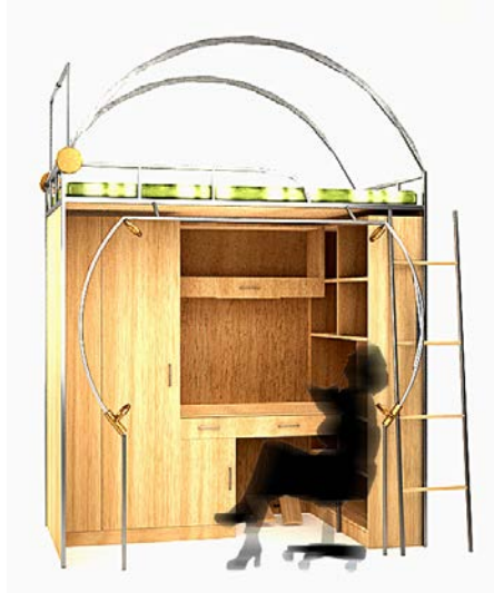
Fig. 6 Pedal

Arch components can be moved along the rails on both sides of the bed, and there are damping foot components near the end of the bed. The arch fixed in the middle position, while people can lie on the bed for the supine bicycle movement. Our posture is more standard when we have fitness-assisted (Fig. 3). The arch can be longitudinal separated into two parts, which are fixed on each side of the bed. While it is used as a frame of mosquito net, the bed would be elegant and privacy (Fig. 4, Fig. 5).