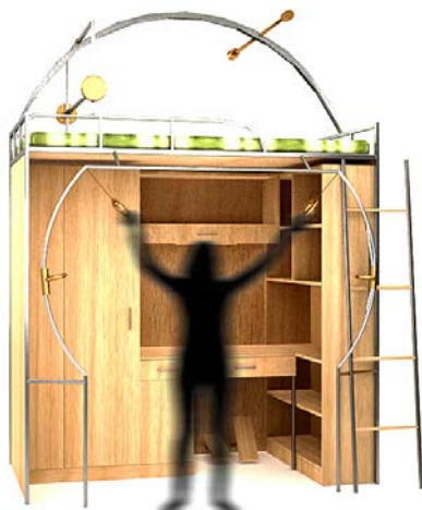
Fig. 8 Pull down motion