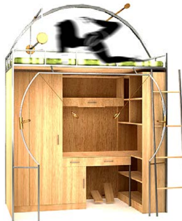
Fig. 3 Cycling