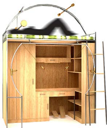
Fig. 2 Weightlifting

Most dormitory furniture is double-deck bed of the upper bed and the lower table, and structure of which could offer more storage space. The privacy of students is need for sleeping, learning, and storage function. but the rigid shape of the dormitory furniture to meet the production requirements by manufacture factory result in the lack of fitness function. In order to create a better living conditions, in the design process, we require to retain its advantages, while improving the privacy, functionality, and aesthetics, so that we can design an easy to use, as well as convenient to carry out the fitness system of the new dormitory fitness furniture.