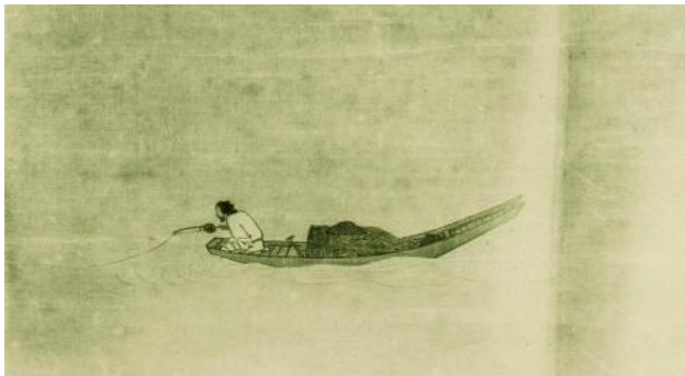
Fig. 4. Fishing Alone

the setting off of ink. The combination of deficiency and excess creates a beautiful artistic conception, so in Chinese ink painting there is no painted clouds and the blank areas become endless cloud sea; no painted water but the blank areas are expansive water; no painted sky but the areas with flying birds are infinite sky... The contrast of blank and ink mark makes ink more noticeable, for it highlights the subject. Meanwhile, blank extends the space of the picture, and makes artistic image deeper. It can arouse viewers' imagination, and guide viewers to taste the purpose of the painter. Thus, viewers could exchange with the painter in the spiritual level, and have a strong resonance. In the Painter Ma Yuan's Fishing Alone an old man alone sitting in the bow was fishing "Fig. 4". The rest of the space is blank. The whole picture is full of ethereal atmosphere. The small picture looks like a vast sea in a moment, and feelings of viewers may be unconsciously calm down, like the old man in the picture.