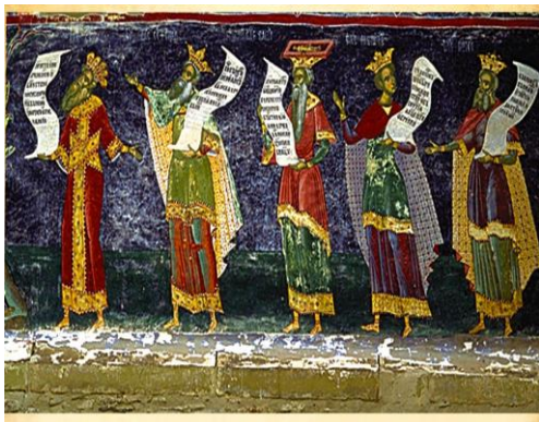
Fig. 1. The Sages of Antiquity. Detail from the Tree of Jesse, Moldovita Monastery.

Besides, it should be kept in mind the precautions against and even disregard expressed by the Fathers of the "wisdom of this world" that the philosophy is associated with. Though they had been elitists, accomplished orators, great textualists familiar with ideas, complex concepts and syllogisms, those practising philosophy was considered by Christians as "so-called philosophers" (Justin the Martyr and Philosopher), a term not at all flattering but at the same time implying the existence of true philosophers, held in high respect and representing an ideal that all Christians should attain.