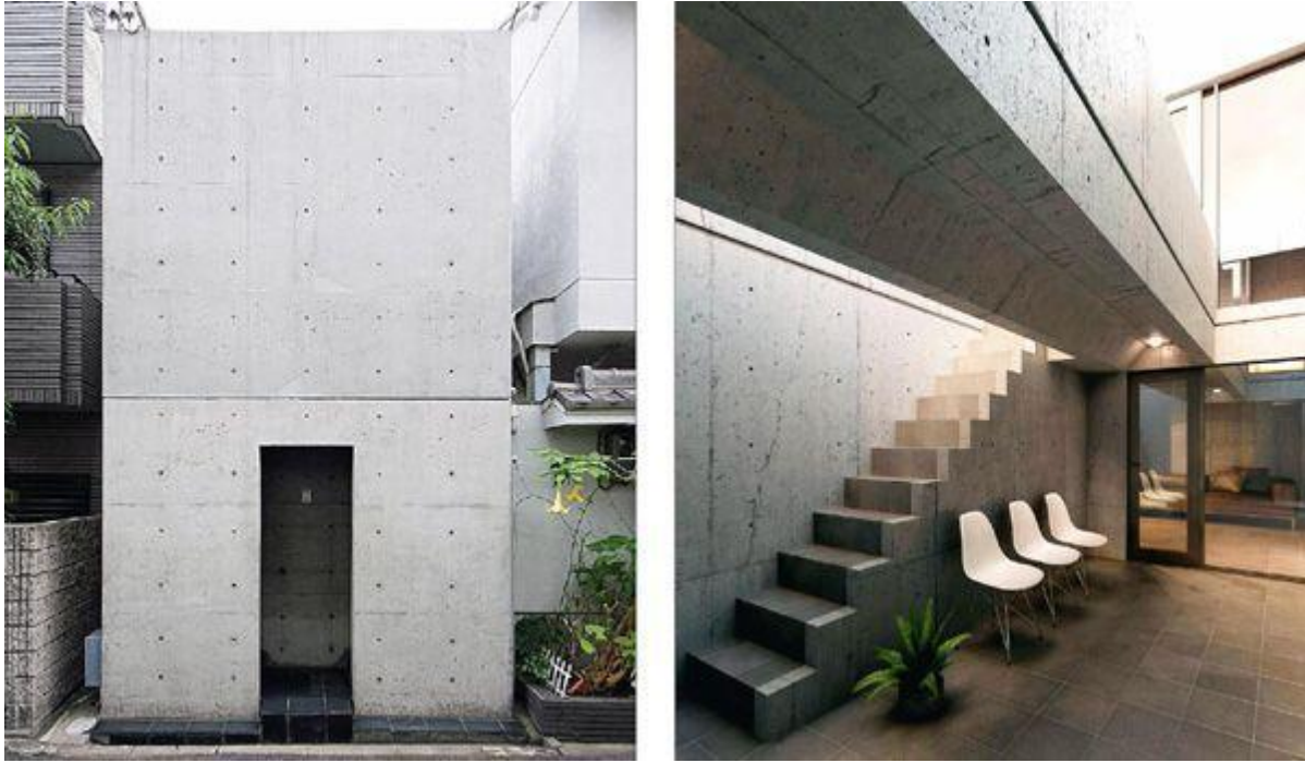
Figure 2. Azume house