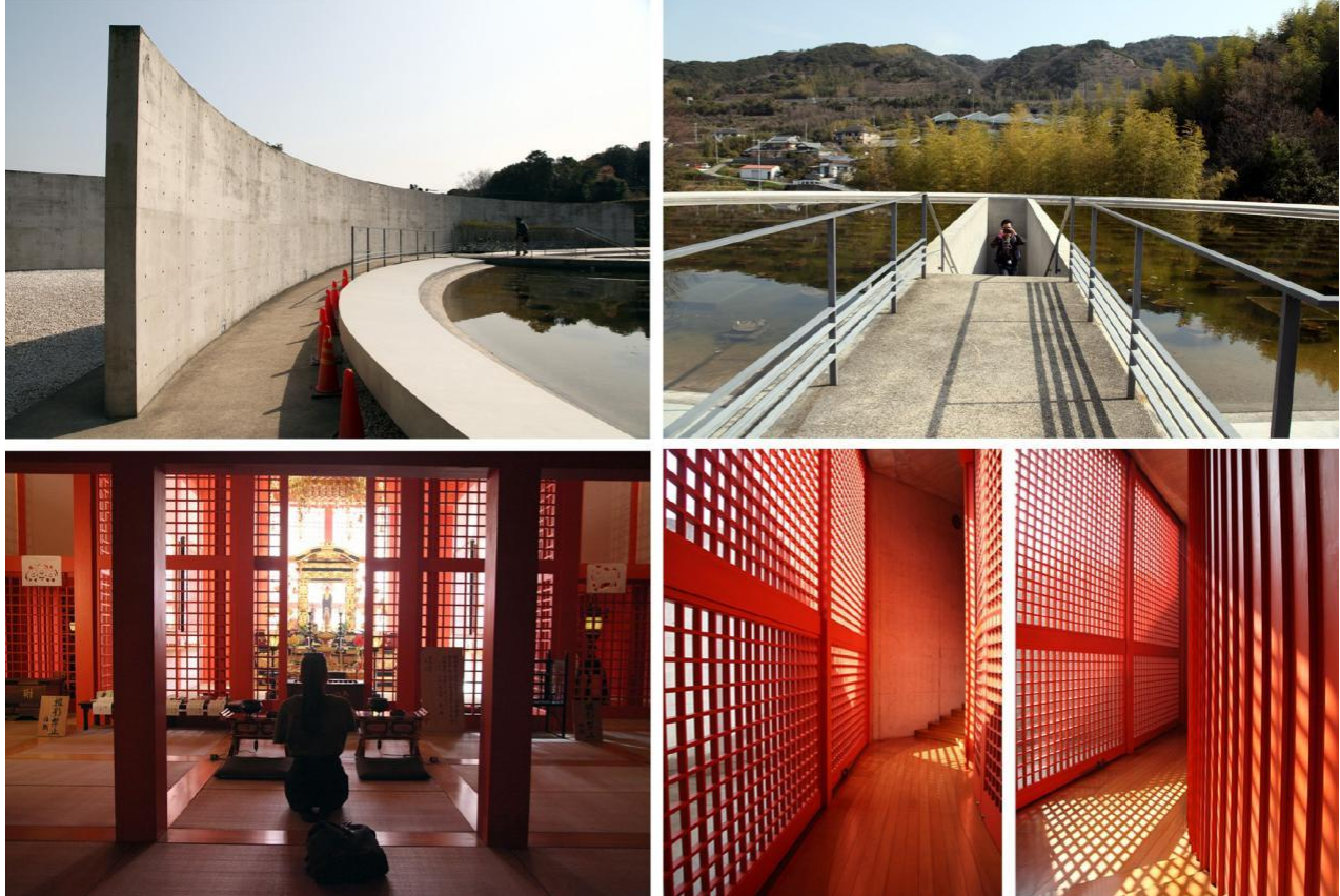
Figure 3. Oval Pool