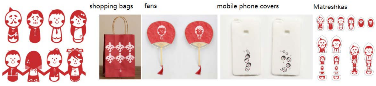
Fig.3 Family Series