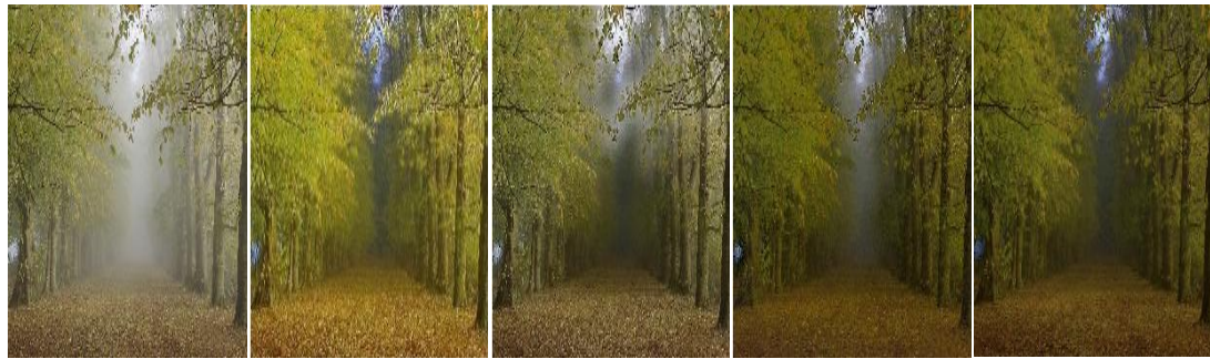
Figure 4. From left to right: input hazy image, restored image by Tarel, He, Zhu, our method.