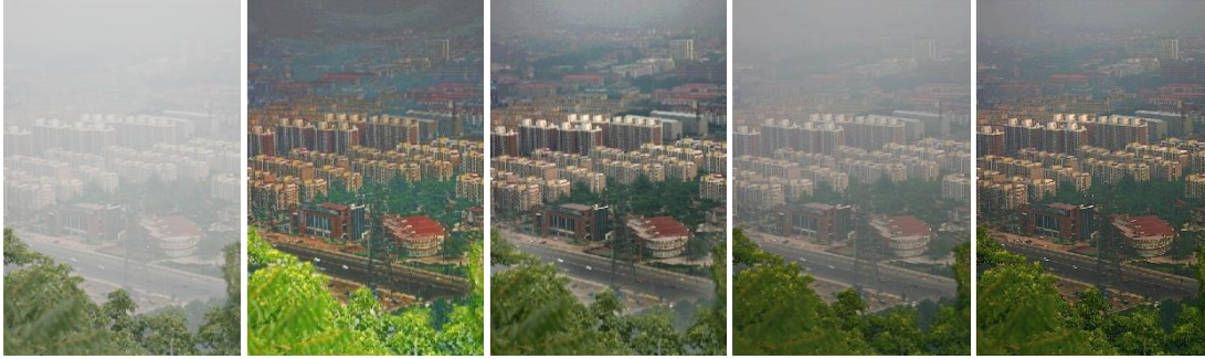
Figure 3. From left to right: input hazy image, restored image by Tarel, He, Zhu, our method.