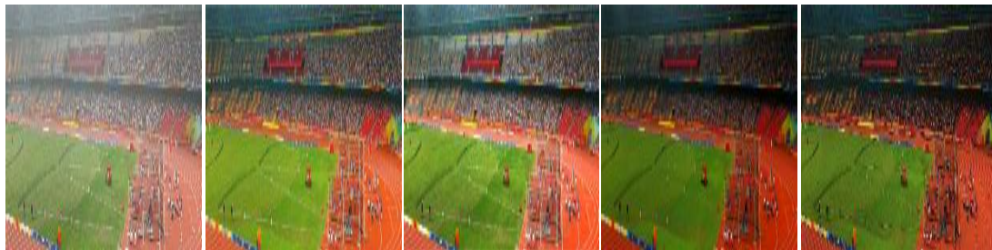
Figure 2. From left to right: input hazy image, restored image by Tarel, He, Zhu, our method.