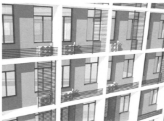
Fig. 2 Cross section ventilation schematic Fig. 3 Horizontal shading and vertical sun shading