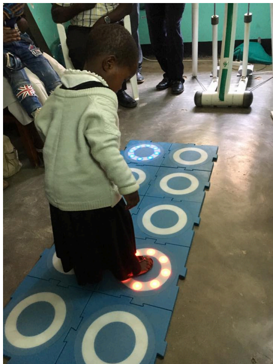
Fig. 3. Playful rehab of meningitis affected child in Iringa Regional Hospital, Tanzania.

representative, national hospital, national health university department, regional hospitals, Living Labs and NGOs performing community-based rehabilitation.