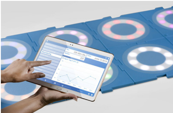
Fig. 1. Moto tiles and app interface ( www.mototiles.com )

The new Moto tiles are connected to a tablet with the ANT+ radio protocol. On the tablet, the user can select between numerous games that challenge both the physical and cognitive abilities of the user. Further, the tablet shows the score in each games, shows statistics for the user, and make automatic documentation of