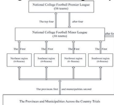
FIG.2 The National College Students Football League (Campus Group) League Format

The system reform of college students football league concerning 5 players . league format Settings. (1) qualification trials of 5 players of the national college soccer league competition within the province.