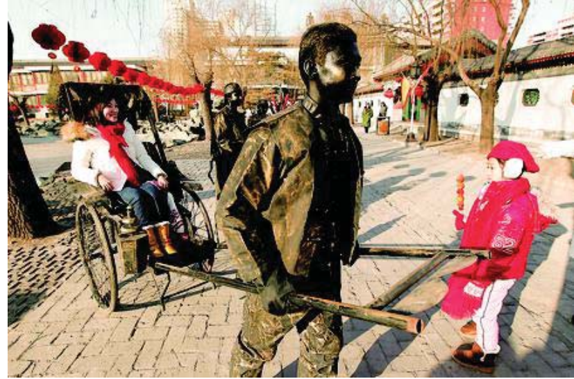
Fig. 1: Contact-typeinteraction of rickshaw sculpture in Beijing