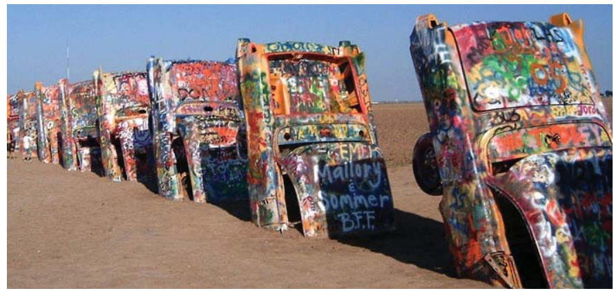
Fig. 3: Devise-type interaction of Cadillac ranch

spaceart. It will be good connection between public art and public space. It fully expresses the communication and interaction between the creator and the public to realize the interactive and democratic nature of public space art.