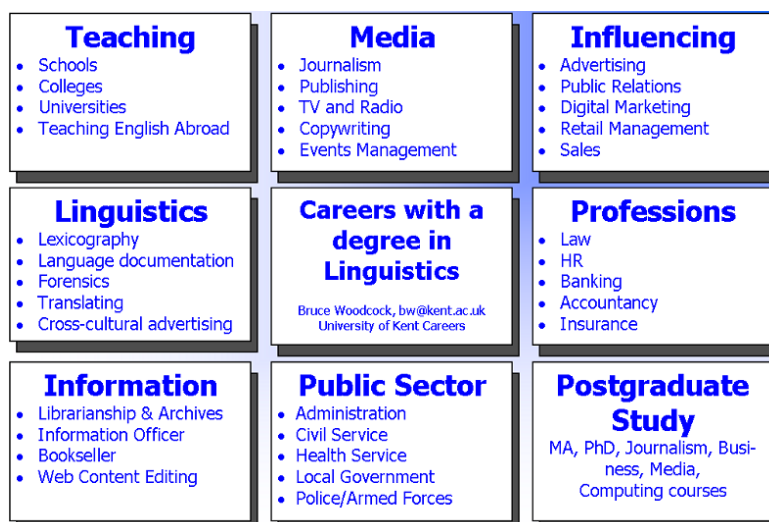
Fig. 1 Principles of Education in Modern Colleges

Carries on the language education to the student at the same time, naturally integrates the education for all-around development appropriately can stimulate to transfer the student well study English the strong interest and the enthusiasm, can to the teaching material content understand thoroughly and can grasp to the language knowledge solidly as well can maximum limit enhance the student to express, the utilization language ability actually which causes the language teaching and the education for the all-around development complements each other that promotes mutually. In this context, China as a big country of English teaching should re-examine the concept of English education and practice. Based on the current context of global localization, this paper will focus on the shortcomings of the English education in China, and point out the necessity of its reform in China, and put forward some suggestions on the specific operation [1-3].