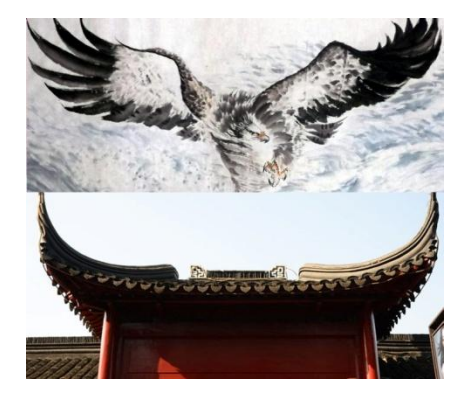
Figure 1. Architecture wingspan of flying posture

The traditional Chinese roof structure is dense and complex, the "Close-packed" roof tiles and the "accumulation" of the brackets, jointly follow the order of the static, and the floating and flexible roof constitute a balanced rhythm, on the ridge, a row of "immortal"