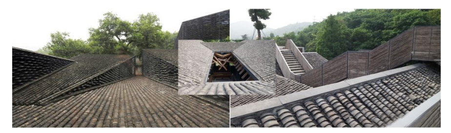
Figure 2. Wa Shan arrangement

lined up and the Owls kisses are facing each other, the order and romance are presented perfectly, revealing the morphological ethics in the analogy between power and law. Therefore, when Wang Shu and Wei Yan in China Academy of Art Xiangshan campus create a "Shan Lin" actually has chosen to "arrange tiles" extension of natural hillside, as shown in Figure 2. Wang Shu even explore the "Qingming River" of the "Row arch" structure, toramming the old rubble composition of the wall as "Wa Shan", the intention is to pass on the traditional skills of Song Dynasty that are simple and unadorned. Xiang Shan campus building has many stretched roof, high vertical walls of plain soil and brick pavement, divergent Jiangnan building unique subtle, It is a simple and concise structure of Bauhaus-style, which is based on the architectural form of Chinese and Western art narrative of the relaxation tactics, to spread the ideal space of living space in architectural form, and to cultivate the social justice system ethics.