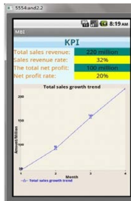
Figure 2. The sales KPI index

This paper uses a database from Yongyou ERP, and chooses 4 years' business sales data as test data. Figure 2 is the the sales KPI index, Figure 3 is the monthly sales between 2012 and 2013.