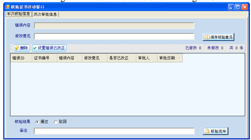
Fig.3 The complete state of checking certificate window

The complete state of checking certificate window is shown in figure 3.