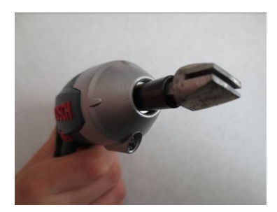
Fig. 5 The centrifuge rotor of electric sealing pliers

We use these two kinds of centrifuge rotor to test all kinds of electric energy meter, the conclusion is that the two kinds of centrifuge rotor in insert and tighten the seal is easier, but in breaking the seal rotating piece is very difficult. According to the advantages and disadvantages of the two centrifuge rotors, we developed the centrifuge rotor of the electric sealing pliers as shown in Figure 5. Its torque of the rotating shaft is larger than the cross-bonding type and flat font type, and is easy to break off the rotating plate of the seal