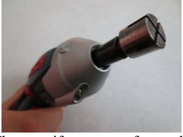
Fig. 4 The centrifuge rotor of cross-bonding

(2) The regular shape are the centrifuge rotor of cross-bonding and flat font as shown in Figure 4, according to this we developed the centrifuge rotor of electric sealing pliers.