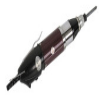
Fig. 2 Three kinds of power tools in common use

The principle of three kinds of power tools is to use the motor as the driving force to drive the output shaft. Their structure is equipped with torque regulation and restriction mechanism for tightening and loosening screw with the tool. The size and weight of the three kinds of electric tools are relatively large, is not conducive to carrying and long time operation. According to the principle and structure of three kinds of electric tools, we design the electric sealing clamp as shown in Figure 3, it can tighten the power rotating sheet seal and easy to break the seal.