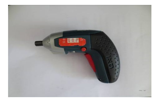
Fig. 3 The electric sealing pliers

The principle of three kinds of power tools is to use the motor as the driving force to drive the output shaft. Their structure is equipped with torque regulation and restriction mechanism for tightening and loosening screw with the tool. The size and weight of the three kinds of electric tools are relatively large, is not conducive to carrying and long time operation. According to the principle and structure of three kinds of electric tools, we design the electric sealing clamp as shown in Figure 3, it can tighten the power rotating sheet seal and easy to break the seal.