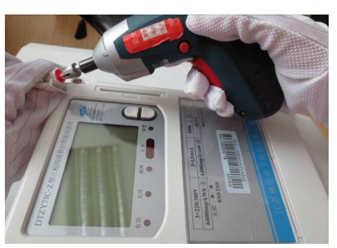
Fig. 7 The effect of electric sealing pliers during use