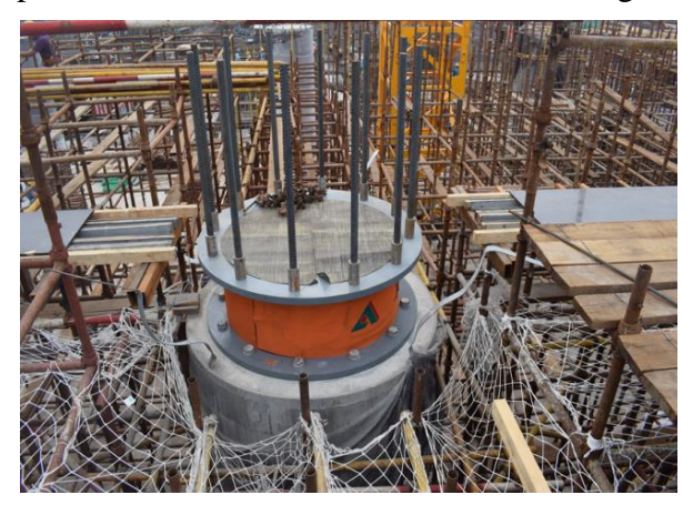
Fig. 3 Installation of Laminated Rubber Isolated Bearing

The final signal workers command tower crane, the tower crane driver will completely drop the tower crane arm, the installation workers then unlock the lifting ring, so that the tower crane and isolation bearing separation, and with a wrench to each flange on the flange bolts, so that the isolation bearing Completely fixed on the support pier. And according to "laminated rubber bearing isolation technical regulations" CECS126:2001 requirements, the construction phase of the project, the monitoring unit should be isolated rubber bearing deformation of the vertical observation and record [3]. Has been lifted to complete the laminated rubber isolation bearing is shown in Fig.3