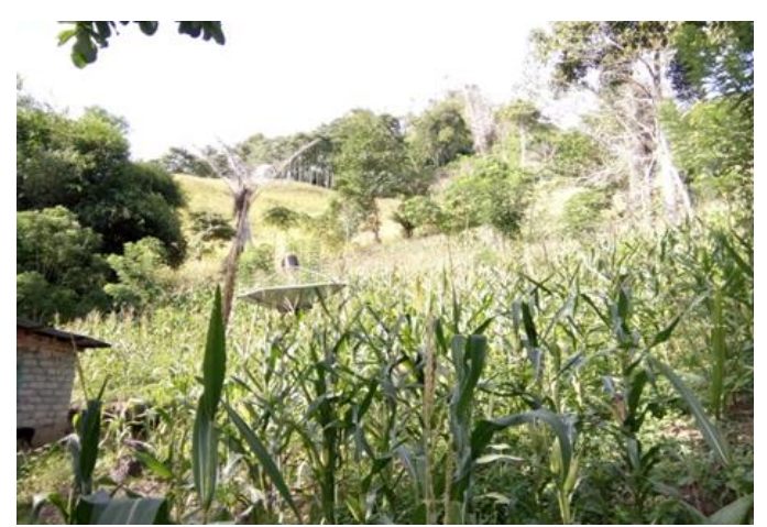
Fig. 2. Corn planting in slope >45%

Based on observations in the field, it was found that corn crop at Gorontalo Regency planted in almost all classes of slope including 0-3%, 3-8%, 8-15%, 30-40% and> 40%. Photos showing the corn planting in various classes of slope are shown in Fig 2 and Fig 3.