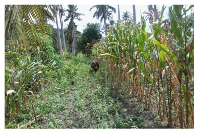
Fig. 3. Corn planting in slope 8-15%