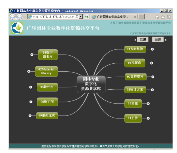
Fig. 7. Guide of resource service sharing

2) Shared teaching resource library and cloud sharing: Through the teaching resources platform under a unified planning and Baidu cloud platform, share course core teaching resources and information, and keep a real-time synchronization with the resource sharing service, making resource use more wider to cover and more convenient for graduates and cooperative enterprises to use online outside schools.