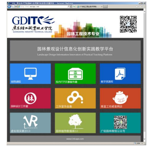
Fig. 1. Informatization-based innovation practice teaching platform for landscape planning and design

The Platform takes "landscape design informatization learning module" as a core, "landscape major digital resource sharing module" and "online communication module" as supports, forming a digital teaching plate with internal and external exchanges, based on which, it builds a "landscape planning and design practice module", meeting the needs of major practice, innovation and startup and keeping a real-time connection with industries and markets. And ultimately expand the influence of this platform through the "external publicity display module", students and teachers will extend their field of vision to the forefront of the industries. The informatization of landscape planning and design course mainly highlights the following three features: