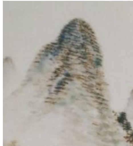
Fig. 5. The partial painted porcelain of "Changjiang Fishing Porcelain Plate" from Cheng Men, the 3rd Guangxu year (1877), 39 cm wide, 25.5cm high. Inscription: Xiaolai Yuqiduo, Bianran Hushanjing. Duyou Buyuren, Qingzhou Shichuru.(In the night the rain and wet air spread all over the lake and mountain road. Only fish-man drove a boat in and out.) ,Spring copy in 1877, wrote by Cheng Men at Xinan. Stamp: Cheng.

harmonious, such as Cheng men's "Cangcui Maoshetu Porcelain Plate". It should be noted that these color collocations are subjective, and its law is not exactly the same with the Western color composition we learned, but also different from folk art color characteristics that we commonly use, so it is worthy of further induced and summarized.