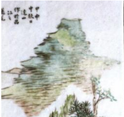
Fig. 8. The partial painted porcelain of "Square Bottle with Flower and Bird Landscape", Wan Ziming, 34.5 cm high.