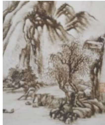
Fig. 1. Partial painting of "Wufeng Huancui Porcelain Plate", painted by Cheng Men

important goal. When he talked about learn from ancient and make creation, he said: "Where the painting regardless of learn from ancients, as long as he can get the taste of painting it is cheerful." In his porcelain painting he was a typical literati painter who focuses on color and considers less on ink, this is not because it is difficult to express ink effect on porcelain, but because of the creation purpose. Although he had carefully created pure ink (black material ⑥ ) on porcelain: ("Wufeng Huancui porcelain plate" "Fig. 1"), ink skill is extremely high, but he just slightly tasted and did not continue this style. On the contrary, he has a great interest to interpret Mi's Clouds and Mountains style with color ("Fig. 2"), so he had many works about it, such as the mountain processing method in "The Fifth plate of Xiaoxiang Eight Sights"("Fig. 3"), "Changjiang fishing porcelain plate", "Zhuli Lutun Tu porcelain Plate" and other works is colorful and full of changes. And he said, "when paint Yunshan it should focus on the quality, no need to copy Mi's", from this we can see that "imitation of Mi's Clouds and Mountains Style" is actually a kind of elegant rhetoric, but in reality he use color to "change Mi's Clouds and Mountains style".