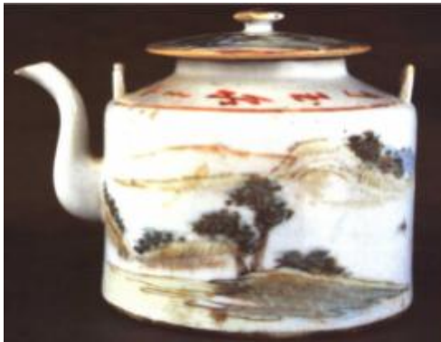
Fig. 14. "Light Crimson Colored Landscape Pot Set" by Shao Meizhi, pot 10.72 cm high. Inscription: Qingshan Hengbeiguo, Baishui Raodongcheng. (green mountain lies on the north of the village, white river circles the east of the village). Shao Meizhi wrote at Chang Jiang Kexuan in autumn of the Renwu year.

Light crimson colored porcelain originally produced in folk, it was shining brightly after the literati and professional painter's transformation. However, there are always some porcelain painting works drawn by the bottom artists to meet the daily needs of general public, gentry and even the farmers, but before these artists have skilled painting technology, their paintings normally with very unadorned and childish expressions. In addition, some officials and literati who prefer light crimson colored porcelain also painted a lot of porcelain painting works, and regard this act as a part of elegance life. As well as the mature artist with good manner freely painted without any rules, these works also belong to this category. Their images often with flawed pencraft, the image is simple and funny, or use strong colors and strong black material to delineate landscape, the screen shows a thick, strong, modesty, simple shaped form features. Representative works are Shao Meizhi's "Light Crimson Colored Landscape Pot Set" ("Fig. 14") and Wang Youtang's "DuMu Shiyitu" ("Fig. 15").