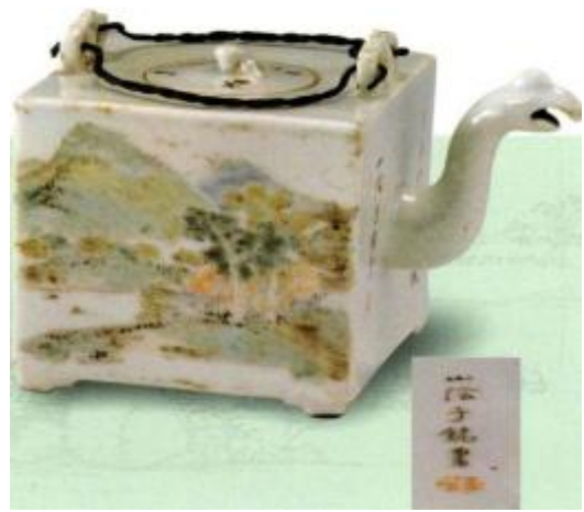
Fig. 10. "Light Crimson Colored Landscape Square Pot With Phoenix-Headed Spout" Zi Ming, style name Shanyin, birth and death date unknown, active in the Qing Guangxu years, good at landscape, flower and bird painting, he was the light crimson colored porcelain artist. Size: mouth 4.5cm, bottom edge 9.3cm, through height 11.2cm. Age: the Guangxu Ren Chen year (1892). Inscription: Yesao Hanying zhulvchen, Songfeng Ruding gengqingxin. Yueyuan Yingluo yinheshui, Yunjiao Xiangrong yushuchun.(At night sweeping the cold snow to boil tea, the tree breeze into the boiler makes the tea more fresh. The round moon shadow fall into the silver river, the cloud melt down the snow on the tree.) Wrote by Shanyin Shuisheng at Wulin Keci in autumn of 1892. Painted by Shanyin Zi Ming. Appreciated by brother Zi Yang.