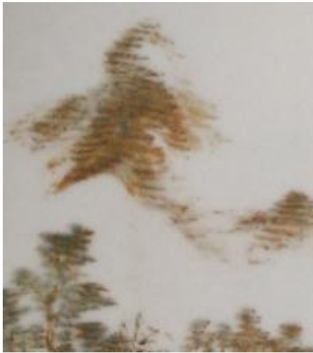
Fig. 2. Partial painting of "The Fifth Plate o Xiaoxiang Eight Sights".