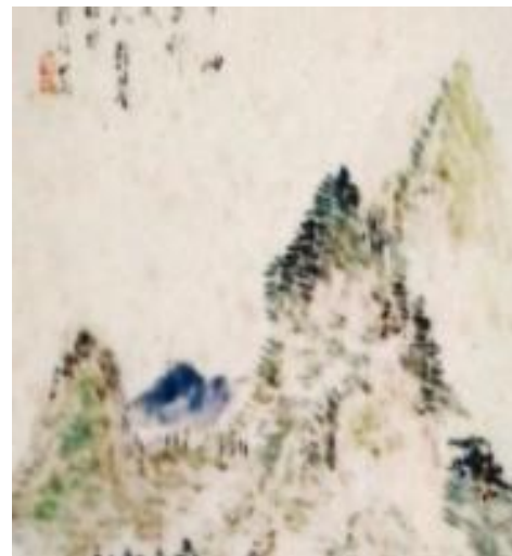
Fig. 6. The partial painted porcelain of "Zhuli Lutun Tu Porcelain Plate" from Cheng Men, the 7th Guangxu year (1881), 40 cm long, 30 cm wide. Inscription: Yuanjing Chuangzhongxiu, Guyan Zhulitun.(Watch the far sight from window, the alone wild goose live in the bamboo forest).Appreciated by Mr. Yue Qing in summer of 1881.