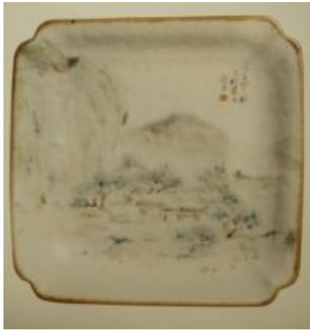
Fig. 11. "Yuanshan Yanyutu High Feet Ornamental Plate" Wu Dayou. 6.5 cm high, 16 cm long. Inscription: Jing Sheng made in Lvci.