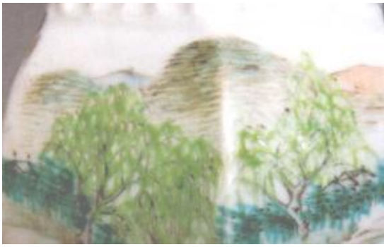
Fig. 7. The partial painted porcelain of "Light crimson colored drum-shaped ewer with flower and bird landscape", the Guangxu Kuimao year (1903), 10 cm high