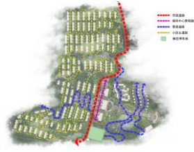
Figure 4. Traffic Analysis Chart