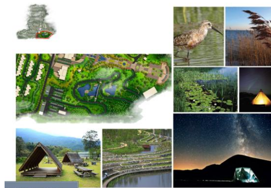
Figure 10. Camping Experience Zone

Camping Experience Zone. A unique tourist camping area is designed according to unique geographical location and altitude of the garden. The surrounding bamboo and wetland provides a more unique entertainment place for tourists.