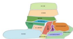
Figure 3. Function Zoning Map