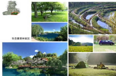
Figure 9. Ecological Wetland

Camping Experience Zone. A unique tourist camping area is designed according to unique geographical location and altitude of the garden. The surrounding bamboo and wetland provides a more unique entertainment place for tourists.