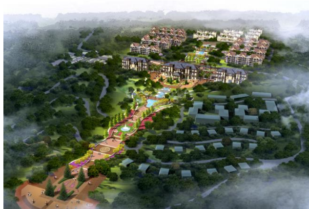
Figure 5. Main Landscape Map

Leisure Landscape and Fitness Pension Center. It is located on both sides of the central axis of landscape and it is not far from the main entrance of the landscape. It can provide leisure, entertainment, some characteristics of farm services and accommodation for visitors. There are also some regional characteristics of the landscape, which can provide food and beverage to let visitors taste green vegetable diet. Chishui's summer is warm and winter is cool. There is mountains, water and convenient future traffic, which is suit for developing hundreds of healthy recreational sports projects, such as tennis, rock climbing, mountain cross-country, fishing and so on to form a various of health sports center. As the basis of sports project scientific research, training, convalescence, commercialization base, tourism vacation and recreation, a number of high standards of sports venues and other supporting sports facilities will be built through the introduction and development of higher-level sports events. At the same time, the construction of sports and leisure training center can provide professional sports training opportunities for sports lovers and provide the necessary support for leisure life.