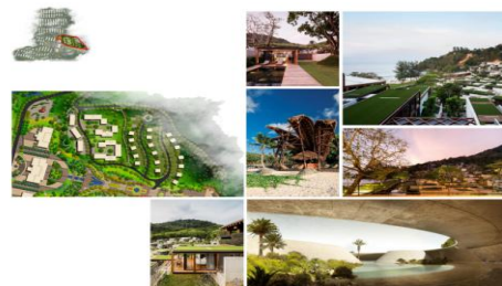
Figure 7. Accommodation

Hot Spring Area and Ecological Wetland Area. Build hot spring club combined with regional characteristics and design artificial wetland area combined with the landscape characteristics of garden. Use superior geological, climate, hydrological and other natural conditions and develop tourism resources to attract natural and cultural tourists. Besides, develop local superior natural