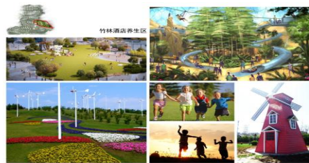
Figure 6. Leisure Landscape Intention Map

Leisure Landscape and Fitness Pension Center. It is located on both sides of the central axis of landscape and it is not far from the main entrance of the landscape. It can provide leisure, entertainment, some characteristics of farm services and accommodation for visitors. There are also some regional characteristics of the landscape, which can provide food and beverage to let visitors taste green vegetable diet. Chishui's summer is warm and winter is cool. There is mountains, water and convenient future traffic, which is suit for developing hundreds of healthy recreational sports projects, such as tennis, rock climbing, mountain cross-country, fishing and so on to form a various of health sports center. As the basis of sports project scientific research, training, convalescence, commercialization base, tourism vacation and recreation, a number of high standards of sports venues and other supporting sports facilities will be built through the introduction and development of higher-level sports events. At the same time, the construction of sports and leisure training center can provide professional sports training opportunities for sports lovers and provide the necessary support for leisure life.