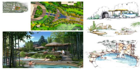
Figure 8. Hot Spring

resources and build hot spring SPA, health park, fitness and convalescent center. Develop huge potential of tourist source and the "silver-haired" source and construct "sunset red" health resort to make it become the second home of affluent class.