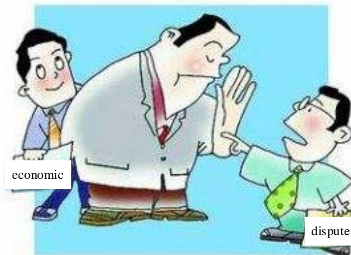
Fig.1 Economic disputes