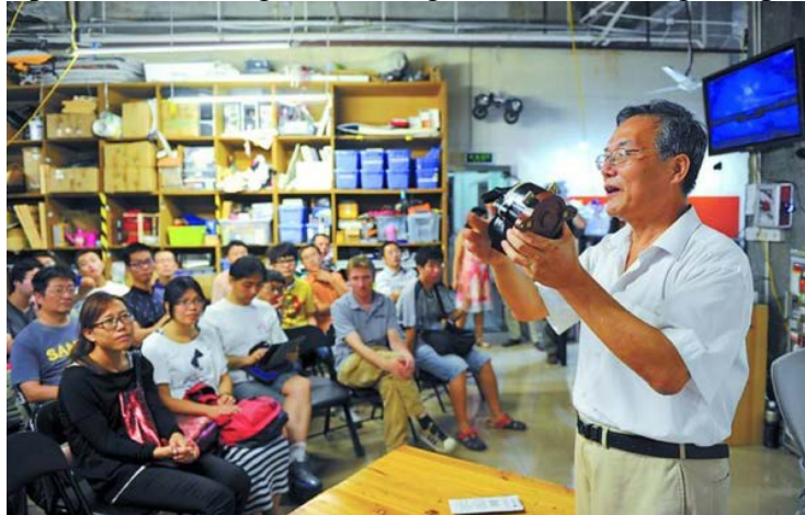
Fig. 2. The teaching and practice platform

The importance of entrepreneurship management courses is becoming more and more prominent. Curriculum construction needs to keep pace with the times, constantly improve the overall quality of teachers, update teaching content in real time, change teaching ideas, improve teaching methods and teaching methods, promote teaching reform. Fig.2 shows teaching and practice platform.