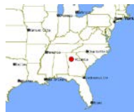
Fig.1 Atlanta: Georgia, United States

Select two mid-sized cities (any city with a population of between 100,000 and 500,000 persons), on two different continents as our research objects.