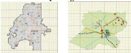
Fig.2 Borderline Shape Graphics of Atlanta and Jiayuguan