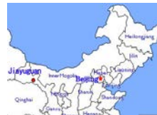
Jiayuguan: Northwest of Gansu Province, China