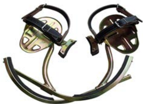
Figure 3 Novel belt structure

In addition, there are a variety of structures, such as the new structure shown in Figure 3. The structure of the transformation of feet pedal and nylon belt, developing original big foot pedal irons into imitation type on the narrow width of the pedal structure, and the nylon belt of nylon belt back out and forming a ring adjustable size to fix the heel. As shown in Figure 3,the new structure is relatively mature at present, and it is simple and convenient, low cost, and no change in innovation based on the structure of irons is comfortable and convenient. But there are still some deficiencies. First, the nylon belt can not realize the stepless adjustment. Second, although the structure effectively fixes the heel part, but to climb the pole still cannot be fixed feet and feet pedal, unable to effectively lift the pedal rod climbing arduous process.