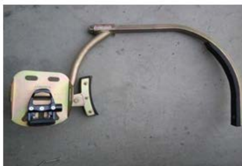
Figure 5 Top view of new irons

Based on the above four points, we searched for the data and finally established the plan. The physical model is shown in the following figure: