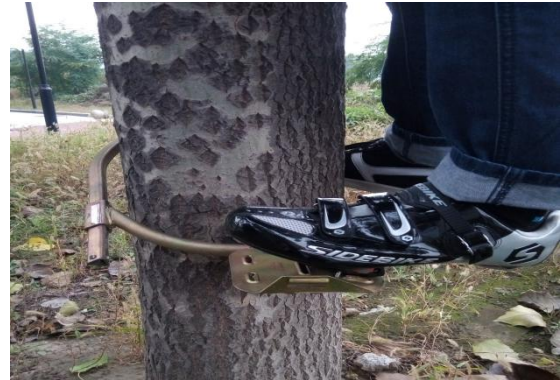
Figure 8 Security verification

As shown in Figure 7, the bottom part of the lock shoe is a locking plate. The bottom of the lock shoe is provided with a polygonal concave hole which is matched with the lock piece. The pits are distributed on the three line of triangular screw hole, which corresponding to the lock plate three through hole. The lock piece by the polygon pits and lock shoes positioning, and then realize the clamping lock plate and the lock shoe by a threaded connection.