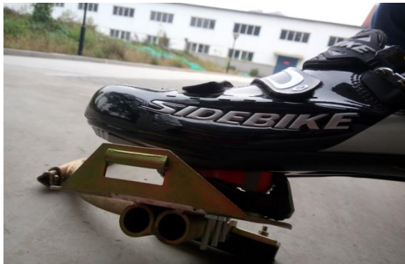
Figure 7 New irons details

Figure 5 and figure 6, the new lock lock step irons from shoe structure with inclined countersunk head screws will lock in place of the foot pedal. The utility model only needs to wear a lock shoe which is provided with a locking piece, and the locking piece is buckled in the lock step when wearing. A spring clamping device is arranged at the tail part of the locking step, and when the locking piece is squeezed into the lock step, the spring device is opened, and when the locking piece reaches the corresponding position of the locking step, the spring device is clamped, so that the connection between the locking step and the lock shoe can be realized.