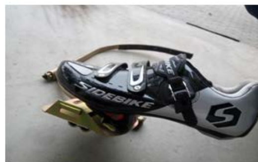
Figure 6 The new irons left view