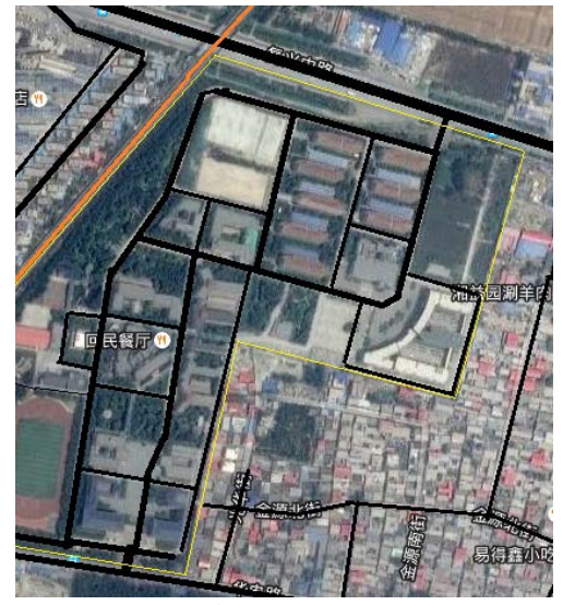
(a) Case aerial map

In this paper, a closed area is selected as the research object, the geographical map, road map and circuit simulation diagram of the area are as follows: